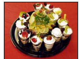
The Desert Du Jour.