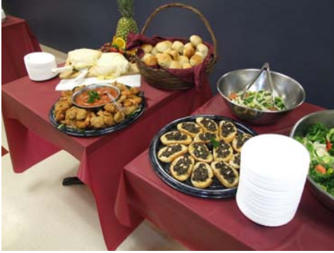
The Culinary Arts Dinner Buffet