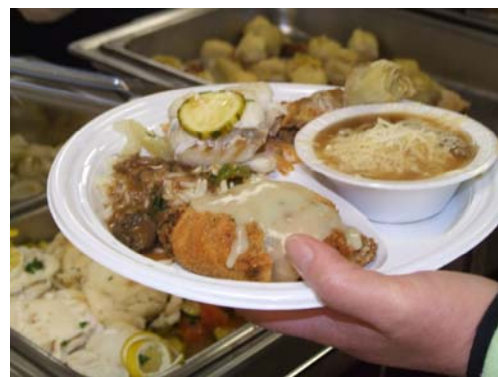
A wonderful plate presentation to go along with the delicious.